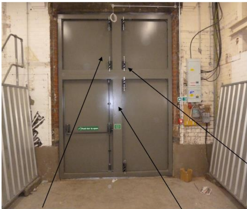
Over panel doors