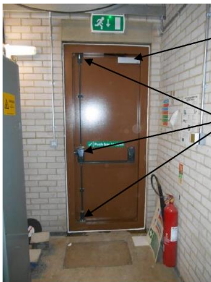
Door closer (on all FR Doors)